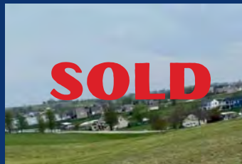
3045 Walters Ave