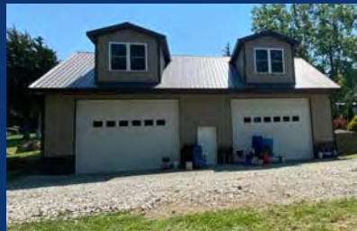
3194 Indian Point