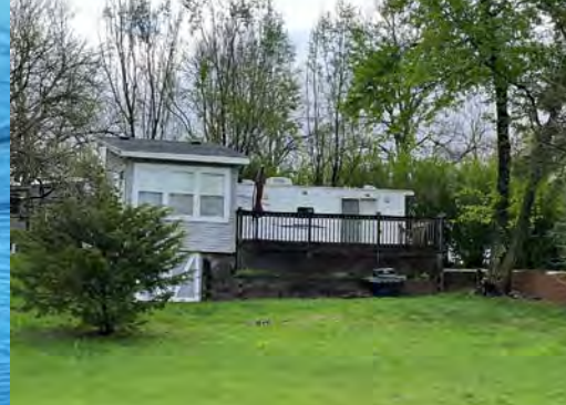
3210 Morman Trail