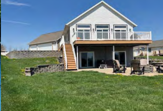
1314 Walters Avenue