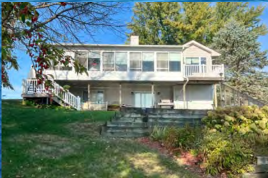
1322 Cherri Lane