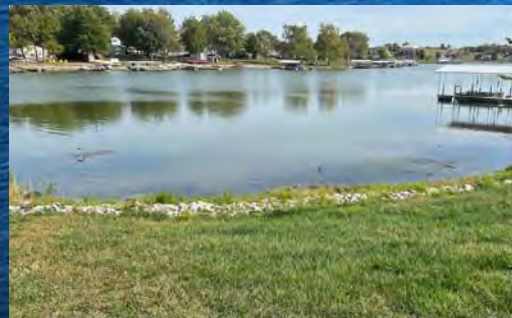
#639 Big Bend Road