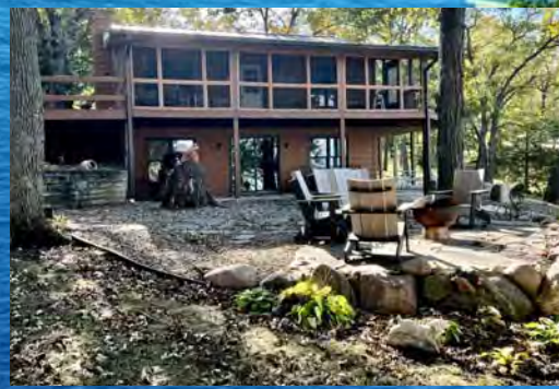
1325 Prairie View