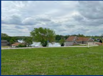
#764 Lakeview Dr.