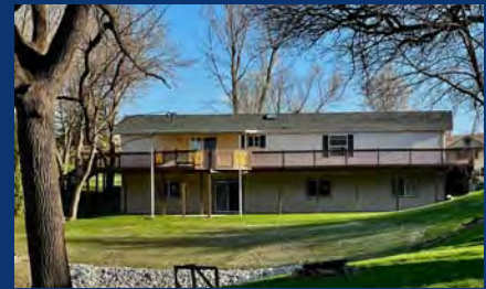
3190 Morman Trail