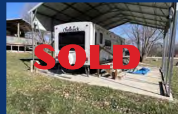
3209 Morman Trail