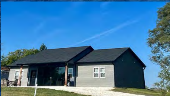
1261 Green Acres