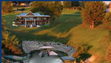
1071 and/or 1072 Windmill Road ~Imagine the Possibilities~