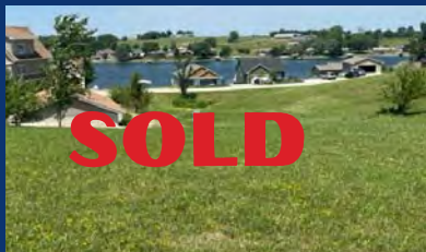
1332 Old Hickory