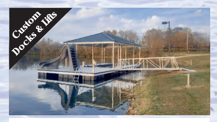
YOUR WATERFRONT IS OUR BUSINESS