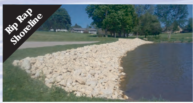
WE COMPLETE ALL PERMITS!