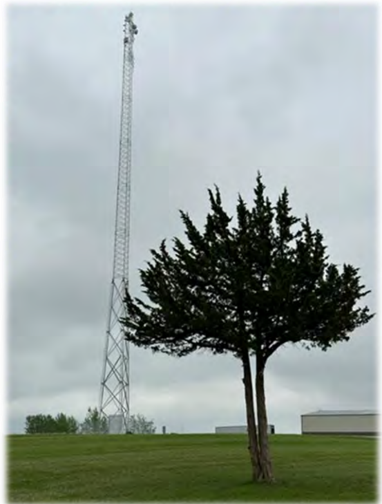
Broadband service continues to improve at the lake with this tower and other line of sight towers being installed.