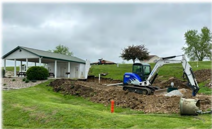
Work was done to remedy the drainage situation at the Beach House.

And there is more in the works! Read the lake manager's report as well as the committee reports included!