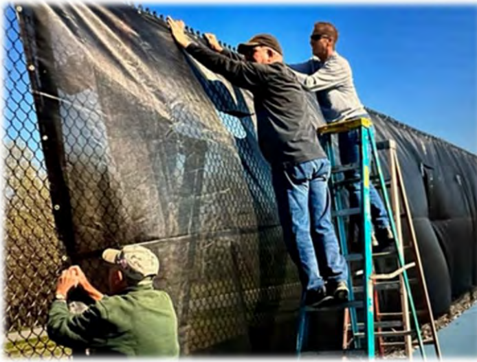
A crew worked during Spring Clean-up Day to hang the wind screen around the tennis/pickleball court.