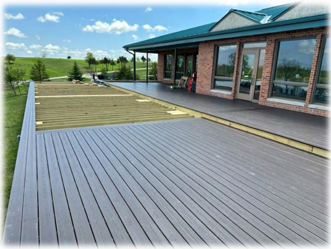
New deck at the Clubhouse! So much room!