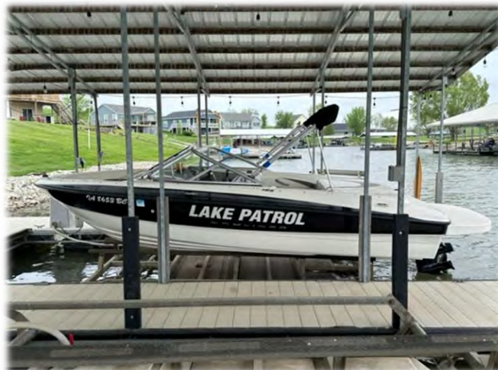
A second boat to be used to patrol the lake was purchased.